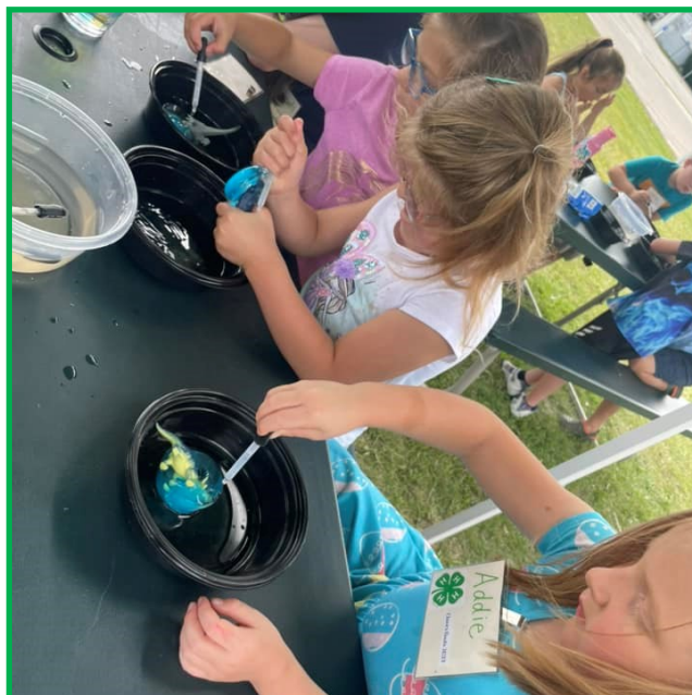
The group of 5-7 year olds engaged in an icy experiment after learning about the ice ages in history, and how they have affected our modern world.