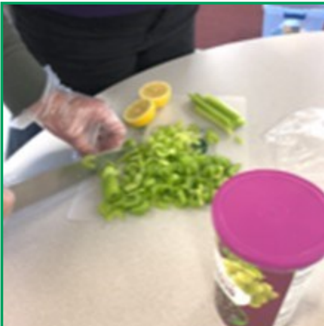
Participants from the PICCOA Po- sen Senior Center prepare "Waldorf Salad."