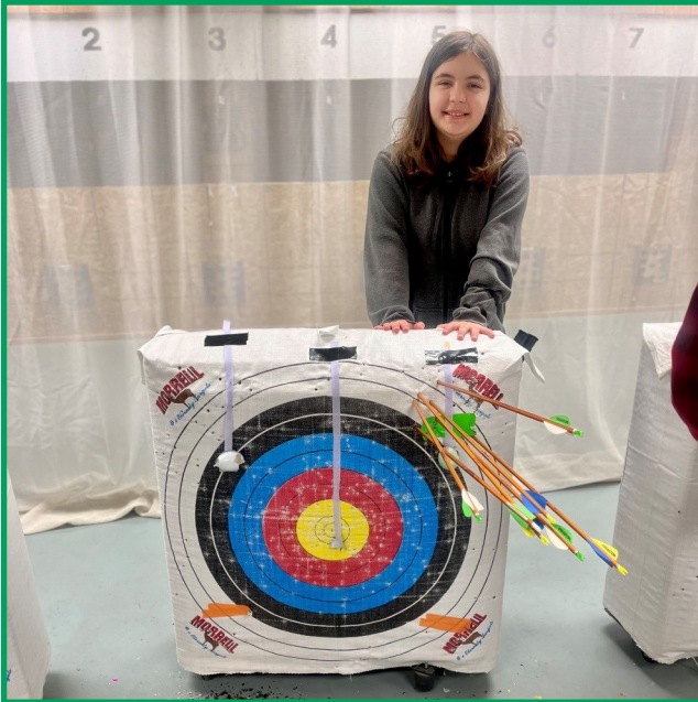
Archery clubs held at both the Black Lake & Presque Isle Sportsman's Clubs catered to a total of 60 youth this past year. Students developed new passions & sharpened their skills in these exciting & focused sessions.