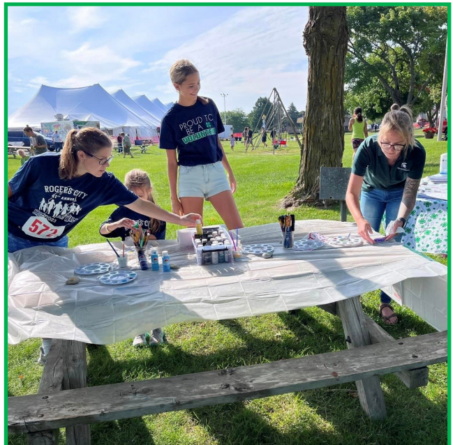
During the Nautical Festival Kiddie Games, 4-H hosted a rock painting table for participants to create keepsakes & colorful pieces for their gardens at home. This event reached 210 youth!