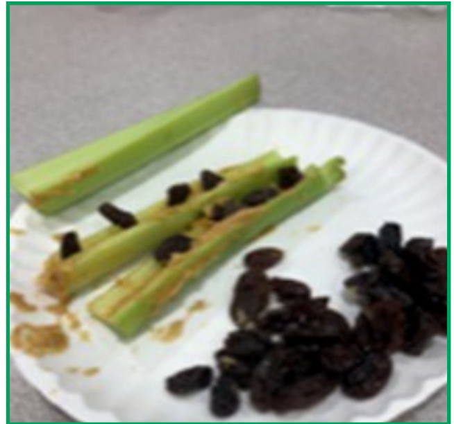
Summer Recreation Program (Presque Isle County) prepared "Ants on a Log."