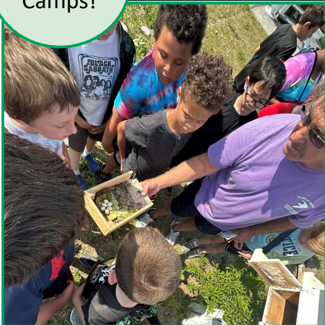
During the Summer Recreation Program, participants visited the Purple Martin Inn & Bird Sanctuary where they were able to witness the hatching of baby birds!