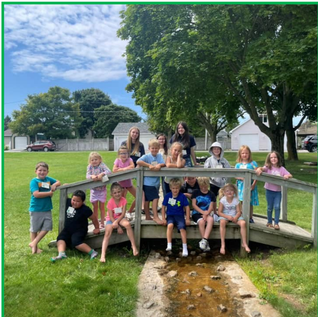
The 4-H Clover Buds enjoyed walking field trips within the community while learning the importance of recycling, the lifecycle of a honey bee, and all there is to know about dinosaurs & fossils