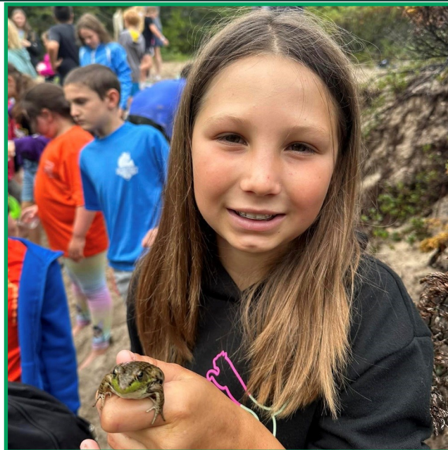
Youth also visited Hoeft State Park, where they participated in a hands-on lesson involving dipping for macroinvertebrates and they found lots of other wild life too!