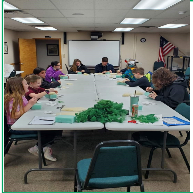
Our Needle Felting Special Interest Club offered a unique opportunity for youth to explore their creative abilities during six sessions of inspired learning and inventive projects.